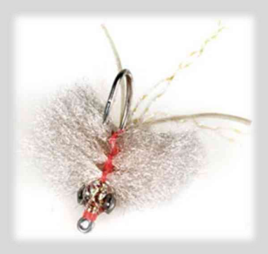
By Paul Cronin, 2008

"For fly-fishermen of the Southern California surf, spring signals the beginning of corbina season. These fish represent the most challenging sight-casting quarry in our area, and most who are bitten by the corbina bug develop nothing short of a lifelong addiction.... Corbina can certainly be caught on patterns mimicking everything from red worms to shrimp and baitfish, but their primary food source during the summer is mole crabs. For this reason, a mole-crab fly can be one of the more productive patterns in a surf fly-fisherman's box.