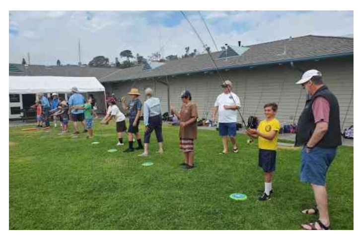
The crew gets the kids into the swing.