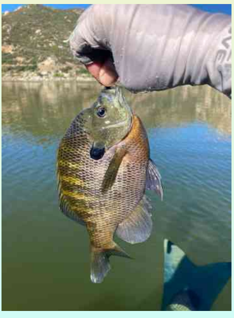
Bluegill big enough to suck down size 6 woolly buggers!