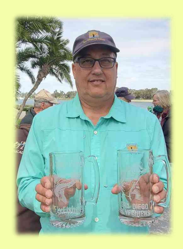
Ask Kai about a custom mug!