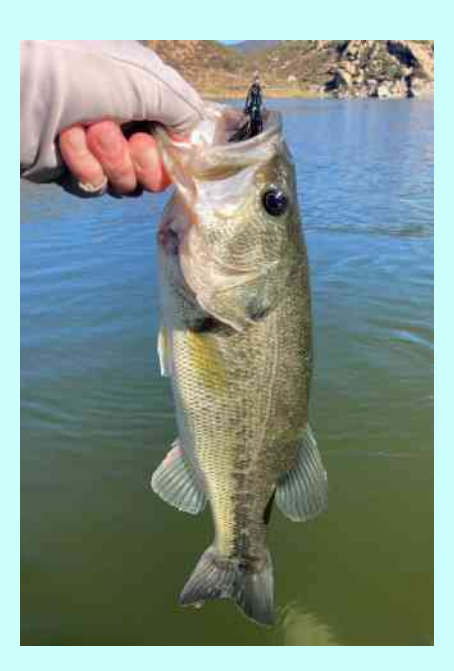
Even a blind editor finds a bass!

Please send us a picture from your trip! Sandiegoflyfishers.com