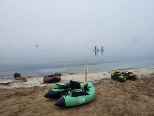
The Foggy Launch