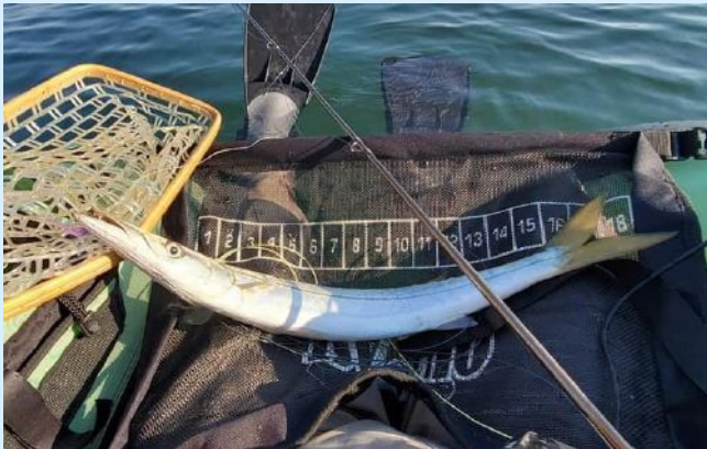
Mel's back bay barracuda!