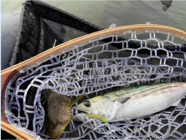
Jim bags the bass/bonito double