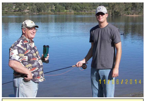
Lucky teaching the importance of coffee

As the new casters became more profient in their casting ability, they began to select targets on the lake to aim their yarn fly. Some of the targets included loose feathers floating on the surface and an occasional duck who strayed too close to casting zone.