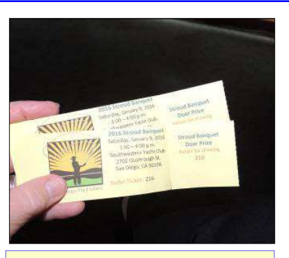
Door Prizes ( the Mrs. holding 2 winning tickets ! )