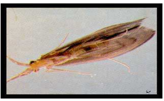
Ventral view of a caddisfly, note the shape you want to cut the wing.