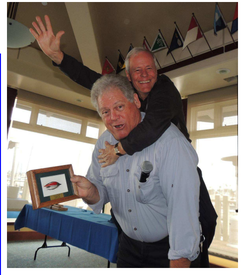
The President has a parasite on his back during the Fly Plate Presentation. Anyone know a good Chiropractor?

Following the awards there was a feast on the deck. Pictures can be found on pages 4 and 5.