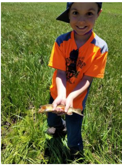
We will be going back (as soon as possible) with a smaller crew to drop the fence. October fishing is always excellent but it can be cold.

I talked to the DFW Trout in the Classroom coordinator. She is checking with our regular TIC teachers to see if any of them want to try running the program online from home. If so, we may need some help setting up their tanks... any volunteers?