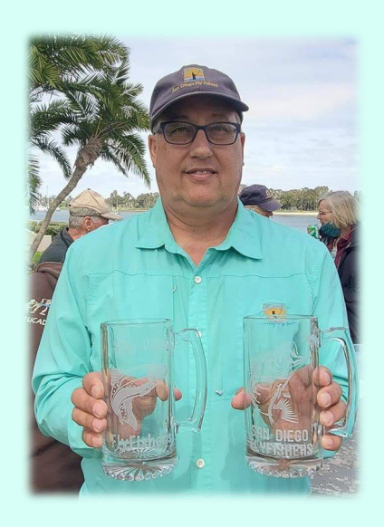
See Kai about getting your very own SDFF mug!