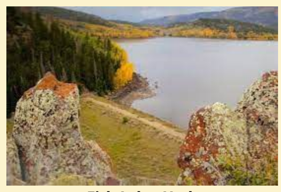
Fish Lake, Utah