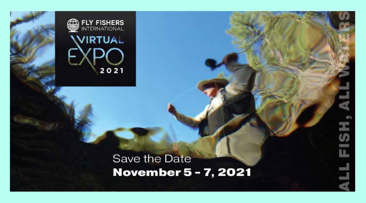
Check This Out!

Fly Fishers International's Virtual Expo