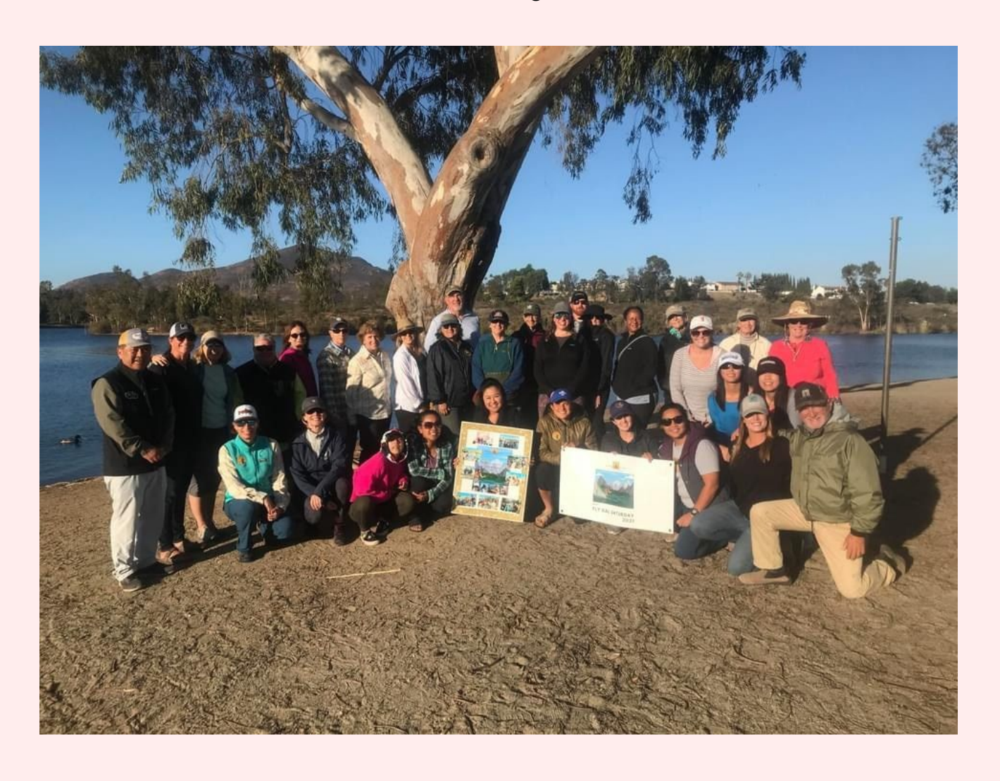
We will have a more detailed review next issue!