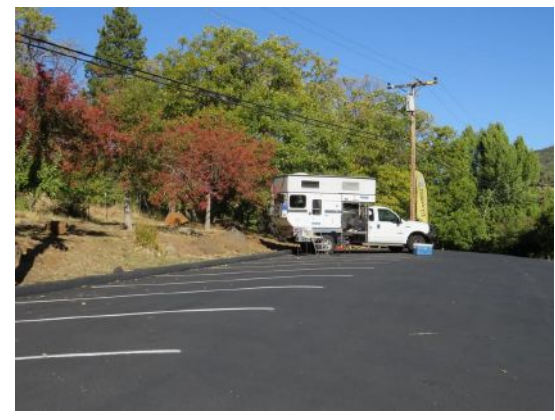
Kai stakes out a super spot for the club on a busy weekend in the mountains.

Well, as Mel says "hope springs eternal!"