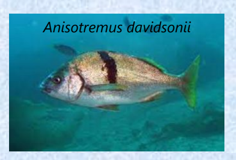
This sargo is occasionally caught in San Diego waters. A member of the grunt family, but probably not the fish in question.