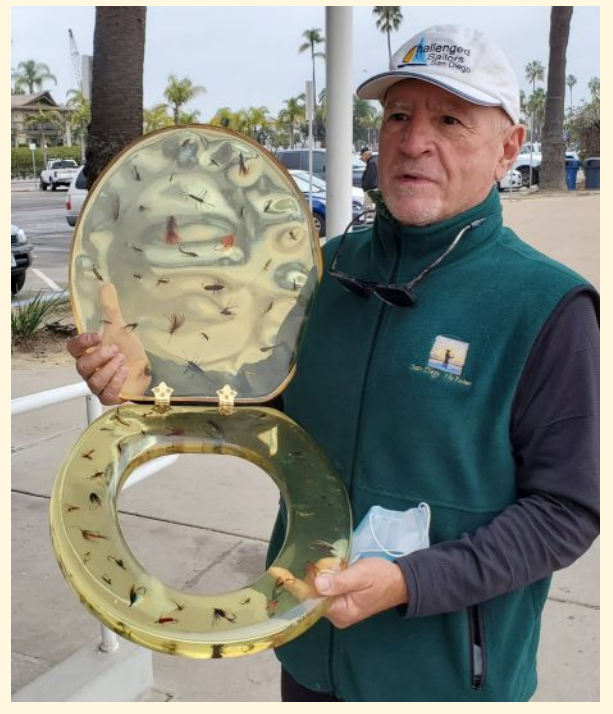
The board, in turn, shows their appreciation of the president with a lovely gift that's sure to please the lady of the house.