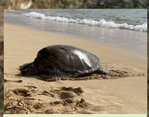
Another not so endangered species to avoid tripping over: the green sea turtle.