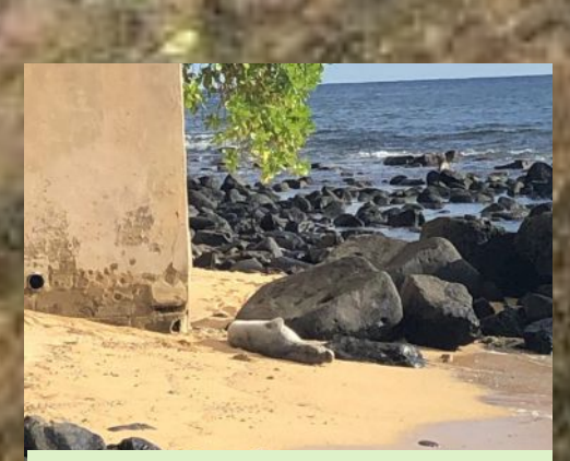
One of the obstacles to avoid when fly fishing Kauai: the endangered Hawaiian monk seal.

One of the Bluefins I caught on this trip was special and has a story. More on that in a bit. I did catch a handful of predator reef fish in the mix. It was not crazy every cast getting struck upper Kern River or Clark Fork River crazy like us trout fishermen sometimes experience. I did have to work for the fish I caught. Frequently I had to work an area for 30+ casts before getting a strike.