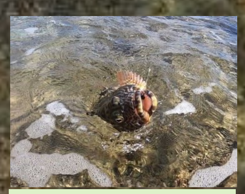
How'd ya like to pull the fly out of the face of this beast?