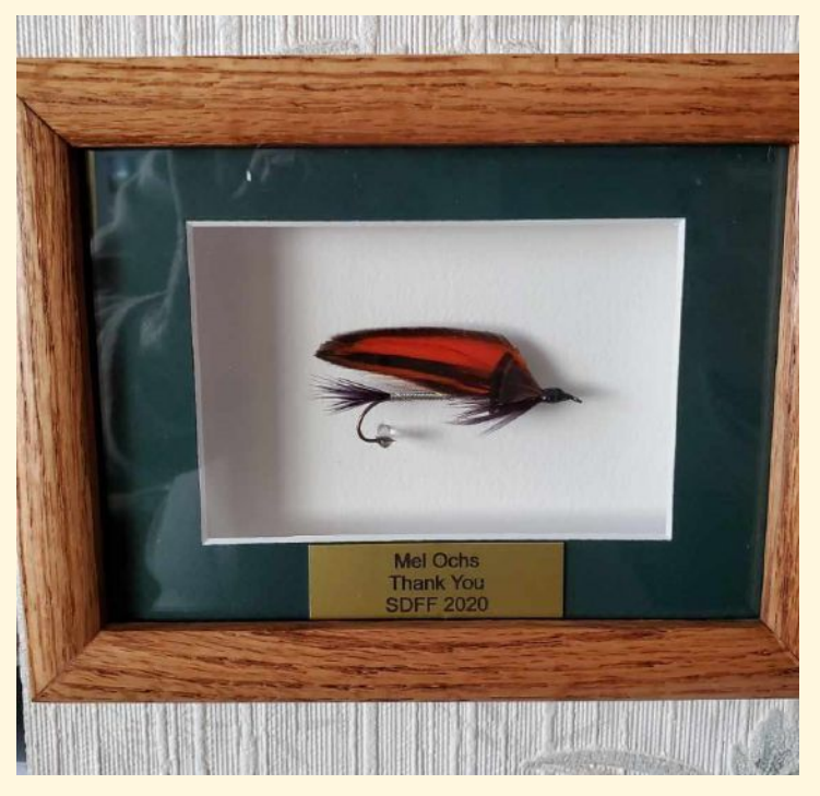
Custom fly plates created by Paul Woolery.