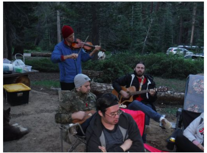
The "not so" Motley Crew