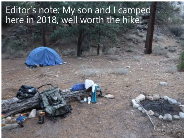
Editor's note: My son and I camped here in 2018, well worth the hike!