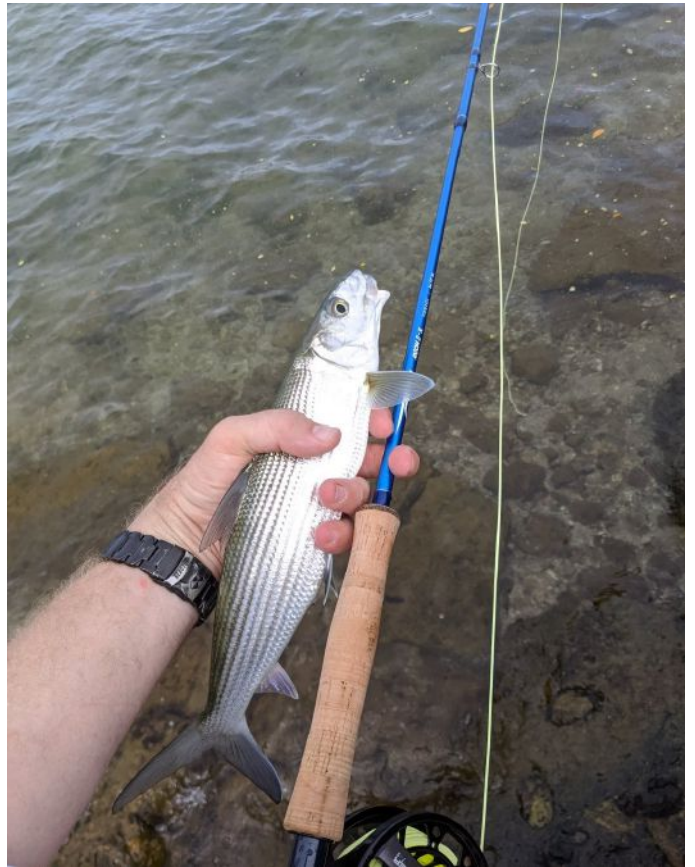
O'io ! Not the biggest but the best because it ends my quest!

As I eased up on the location I could see the water was a bit cloudy. I could see a bit but not as far as I could at the other location. It was enough as a dark form ghosted past. I was in an intercept position where I could cast, let my fly settle, and wait for a fish. It worked. After a few minutes, a pair came in. I swam the fly to them but was too slow and they swam past it and out of sight. I began to strip in to recast. Bam! Something grabbed my fly and was taking off like a torpedo. Line flew through my fingers. Almost immediately the reel was singing that siren song fisherman love. I maneuvered along the rocky shore while the fish ran into a spot where I could land it. Just about when I thought I'd see backing go out the guides, the fish slowed and I began to gain back line. About half way in, it took off again and I watched line melt off the reel. This run was short and when it turned I began regaining line. Moments later my prize was in hand. Not a big bonefish by any standards but not tiny either. I would have been elated with a foot-long fish. This was a trophy that took me nearly a decade to catch; it was worth it, I finally got bonefish slime on my hands!