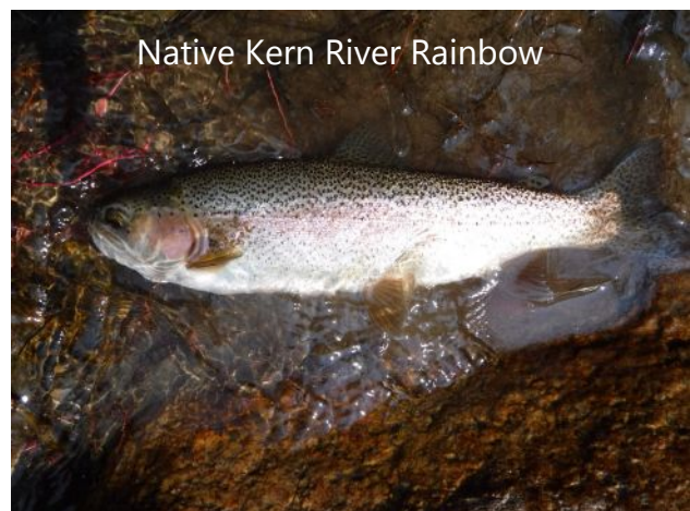
Native Kern River Rainbow