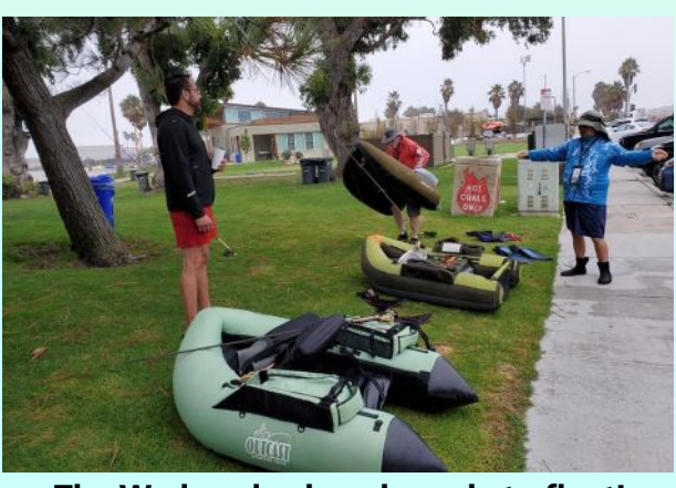
The Wednesday bunch ready to float!