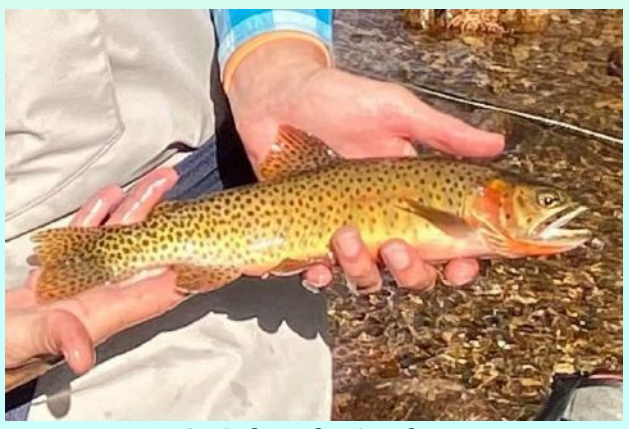
Jen's Colorado Cutthroat!