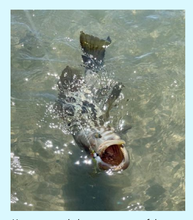
You gotta yank the groupers out of the mangroves quickly or they'll break you off in the roots.