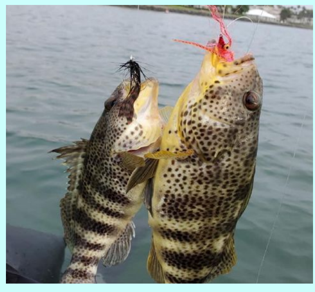
Mel's double at Liberty Station!