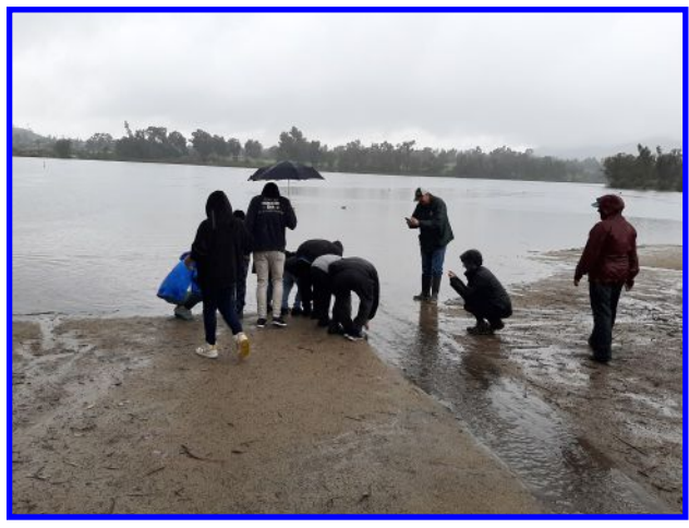
Lake Murray feeder creek, courtesy of the storm