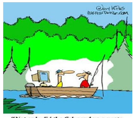
"Not only did the fish send us a nasty email, it came with a virus."