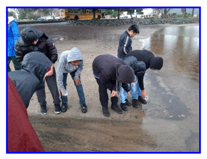
Spirits not damped a bit!

Follow all the action on the Club's Facebook page.