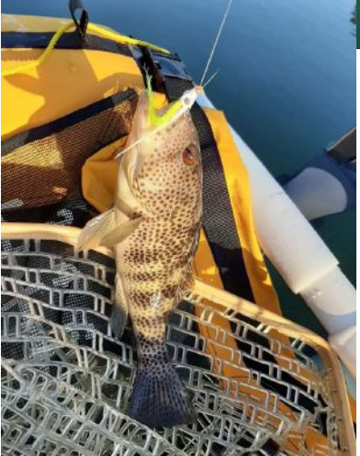
And one on the yellow.