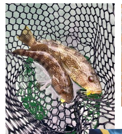
Queenfish are showing up in the bay. (halibut food!)