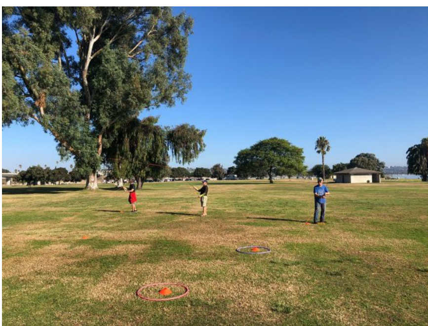
Intermediate Casting Class