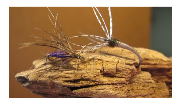
The lowly Soft Hackle

The soft hackle fly has stood the test of time.