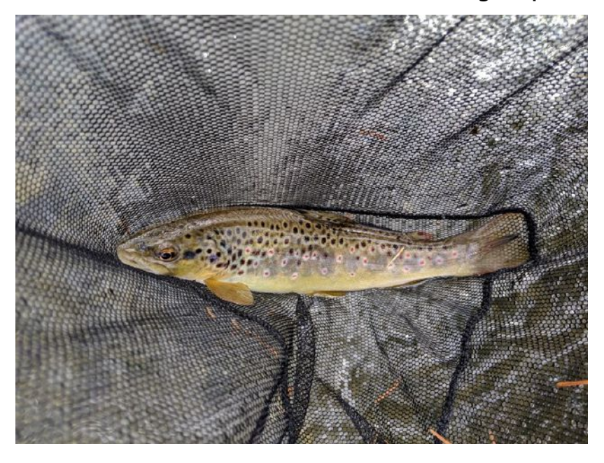
Pennsylvania Wild Brown

I decided to make a downstream drift, as the narrow channel would force me to keep part of my leader on the bank and reduce the distance I could drift a fly drag free. The water was crystal clear and I knew the fish were spooky, so I stayed well up stream and limbered up a cast. I laid it out, pulling up short to cause the line to puddle and give me the drift I wanted. It worked, but the fish missed the fly. I presented the same cast and this time the hook found purchase. It was a wild brown trout of maybe 5 inches. Not a trophy in size for some, but certainly in all respects a prize for me. I'd been looking at this creek for months and fished it without success a dozen times. Now, on a dreary winter afternoon, I held my quarry. The barbless hook slipped out with ease and the fish darted off for cover. I no longer felt the chill in the air; that first little fish warmed me right up.