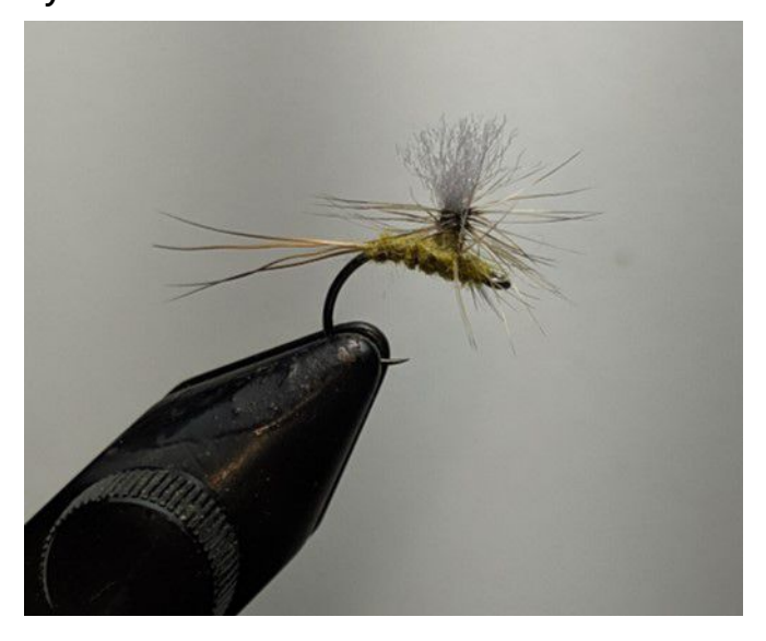
Figure 2 Basic BWO Parachute

I went home and into my basement lair. My bench was neither organized nor prepared for tying, but I found some hair, dubbing, yarn, and hackle. I have been using Firehole Stiks for my trout flies and I really like them. I also like that they are from a Montana company that is family owned. I used a Firehole 413 competition hook in size 18 to tie on a tail of 4 white moose hairs, a body of fine synthetic olive dubbing, counter wrapped with a loop of thread, a wing of grey poly yarn, and a Whiting dun neck hackle. I prefer a parachute style fly most of the time and that is what I turned out. I also tied a soft-hackle, spinner, and cripple with that same materials while I had them out. Six flies in 30 minutes, I could still fish a bit before I wrapped up my paper. I can type when its dark out and these fish would not be rising all day.