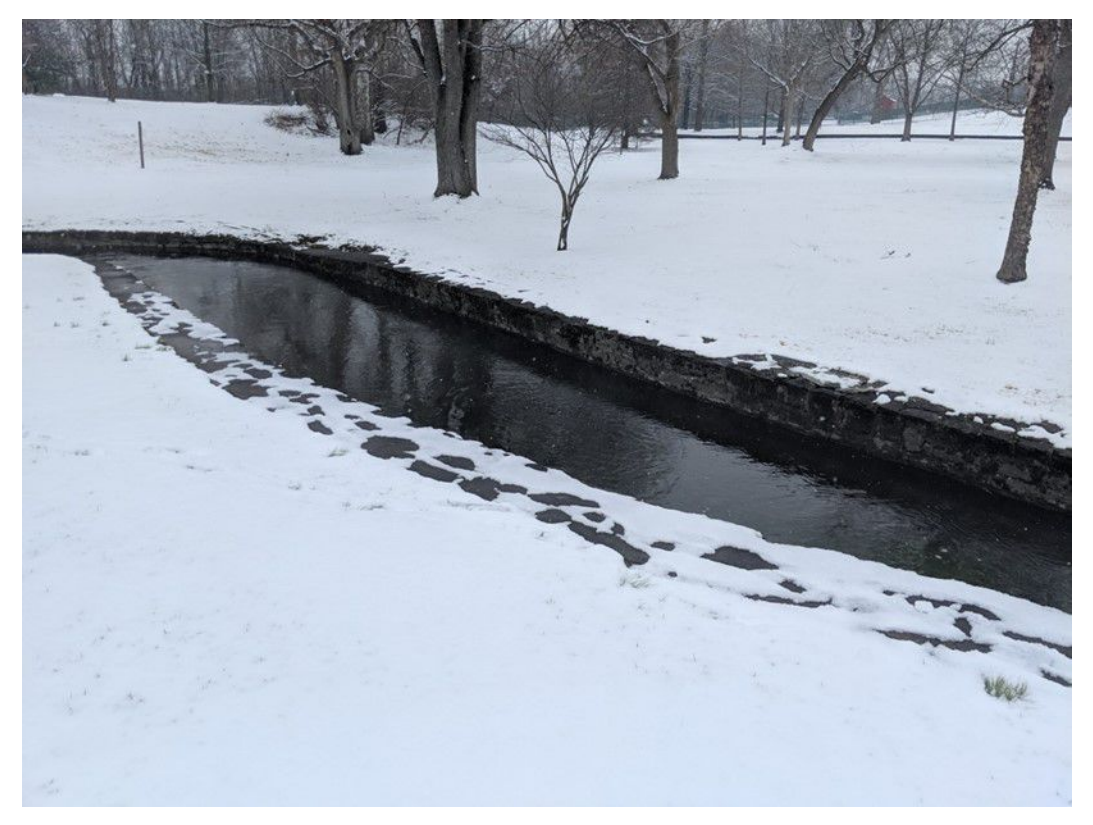
Figure 1 Letort Spring Run

I was very fortunate to have ended up in an assignment that had a trout stream right outside of my quarters. My back porch over looked Letort Spring Run as it cuts through Carlisle Barracks. It is not the marshy spring creek that flows on either side of the base. Here, it is a disciplined and regimented waterway, hemmed into a man-made channel of stone and mortar. No undercut banks, no tree roots, nor any other structure to provide fish with security. It runs for about a half mile further beyond my quarters before it exits the base and joins the other branch after flowing under Post Road. In the stretch below my home there was a bit of cover, in the form of some deeper pools formed at bends in the flume. These were the places I have seen a few small trout, though one source assures me that in the fall there are bigger fish in there. Personally, I'd not seen a fish over six inches long in this stretch. I'd seen big fish above and below the base but not here. Still it is lovely water and nice to know that I could look out my window at a famous trout stream.