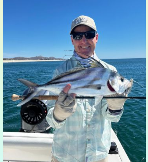
Judge rules a Baja Gallo!