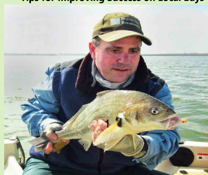
Tips for Improving Success on Local Bays

A PDF of Craig's presentation was attached to the last Indicator (August 1) and can be accessed from the SDFF website as well.